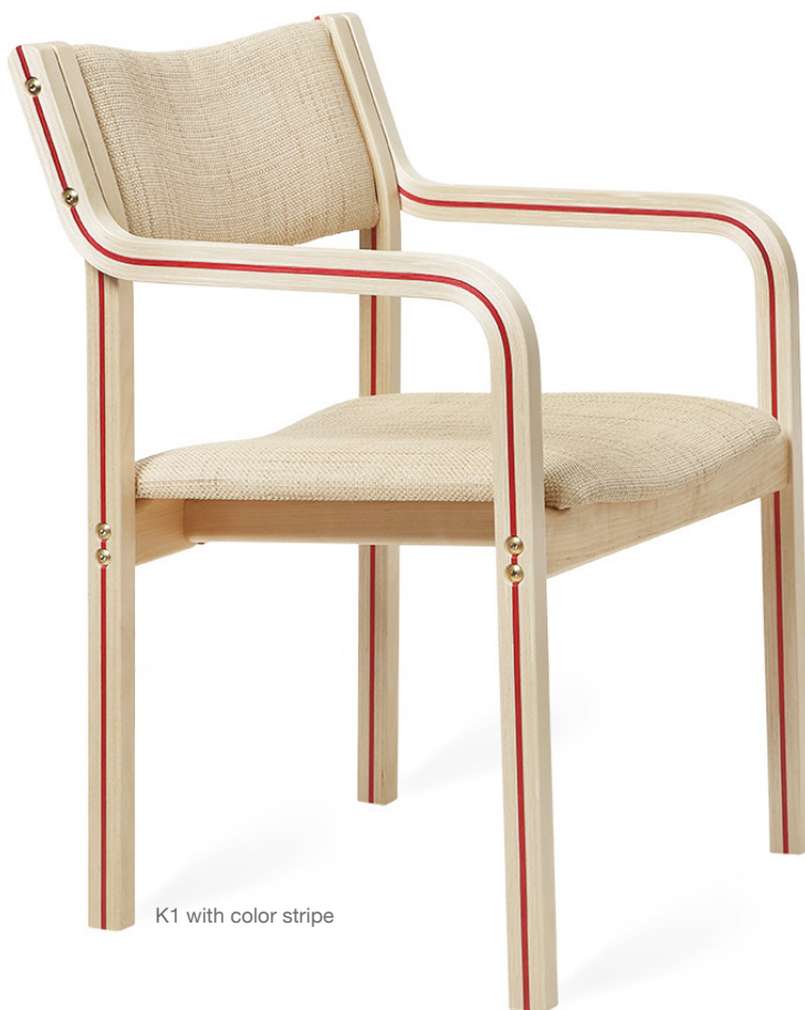
K1 with color stripe