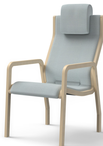
KXYN + removable neck pillow