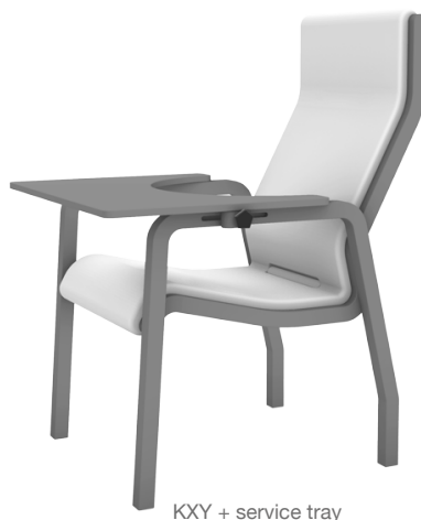
KXY + service tray

Removable neck pillow (code: KXYN) Upholstery: thicker upholstery +10mm or +20mm Higher bases: seat height max +3cm Service tray Birch plywood, white laminate surface Adjustable depth, lockable